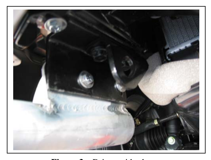
Figure 3 – Drivers side shown