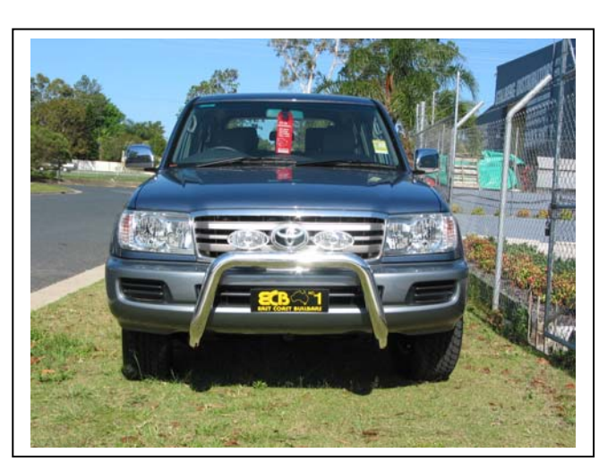
Figure 7 – Landcruiser model front view shown