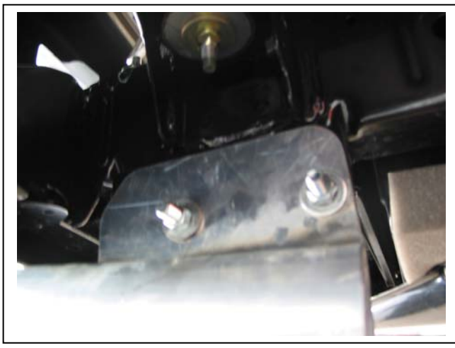
Figure 4 – Passenger side shown