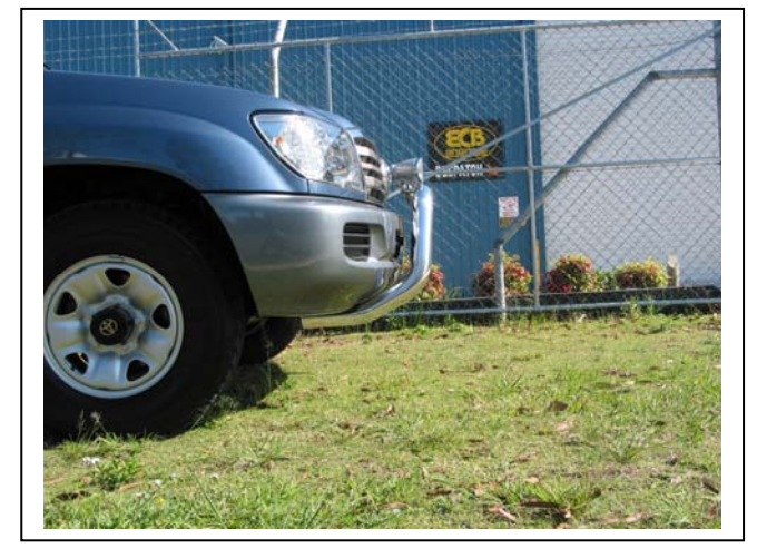
Figure 5 - Landcruiser model side view shown