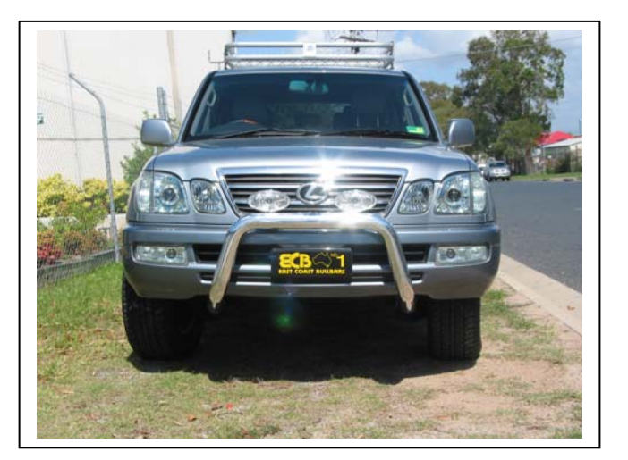
Figure 6 – Lexus model front view shown